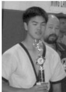
GLKF '07 1st