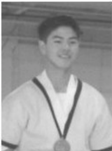
GLKF '06 2nd