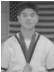
GLKF '06 1st